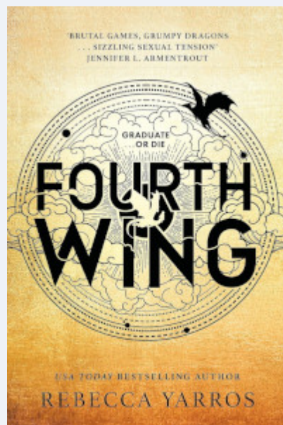
Fourth Wing by Rebecca Yarros

A galactic epic examination of politics and power among corporate families vying for the galaxy's most valuable resource.